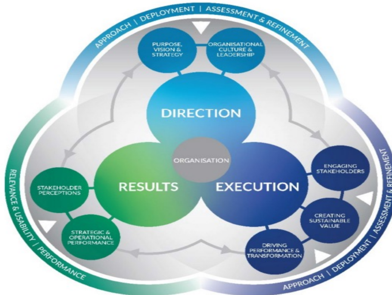
Figure 2. The EFQM 2020 model. Reprinted with permission from [33]. ©EFQM 2021. The EFQM Model is a registered trademark of EFQM.